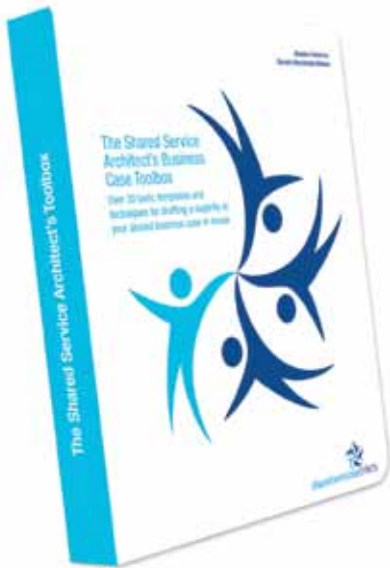
The 230 page Shared Service Architect's Business Case Toolbox