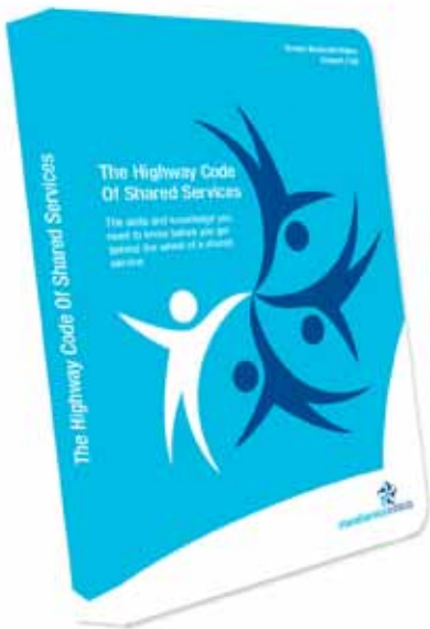
The 10 section Highway Code of Shared Services Knowledge Bank Folder