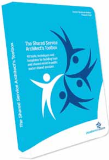
The 240 page Shared Service Architect's Toolbox