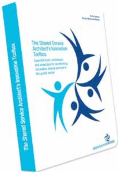
The 130 page, Shared Service Architect's Innovation Toolbox